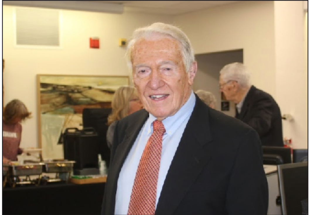
Marv Levy at the 2017 Founders Award Ceremony

"I got out early in 1946 and I was recruited to play football at the University of Wyoming," said Levy. "It was my first semester of college, and while I was there the football coach didn't allow us one second for studies! It was all football, football, football, come back and work out.